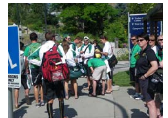
Women's Basketball (left) Men's Basketball (below)