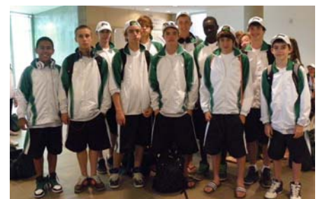
Tennis (left) Wrestling (below)