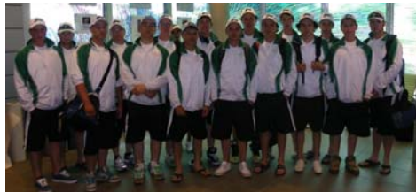
Men's Softball (left)

Please note that all knapsacks, sport bags and coats must be checked at the bag/coat check before entering the dining area. Participants are encouraged to keep their bag-check items to a minimum to help prevent lineups and misplaced items