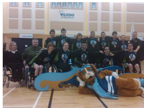
Wheelchair Basketball wins bronze after a heart stopping play-until-the-last second game against MB. (right)