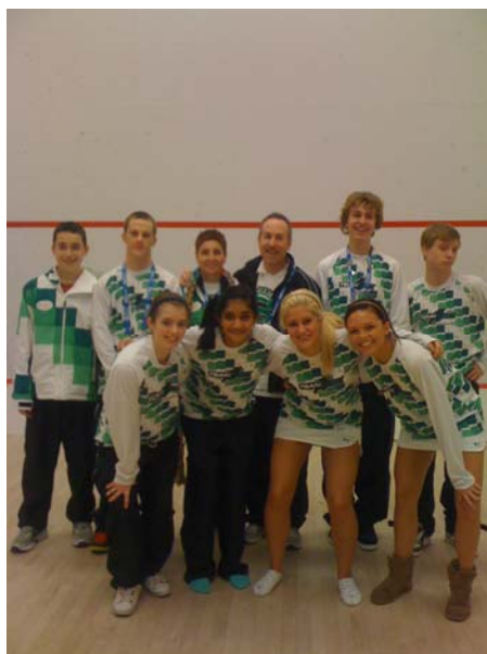
Squash Male and Female (left)