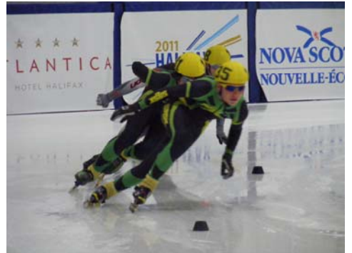
Lucas Morin— Short Track (above)